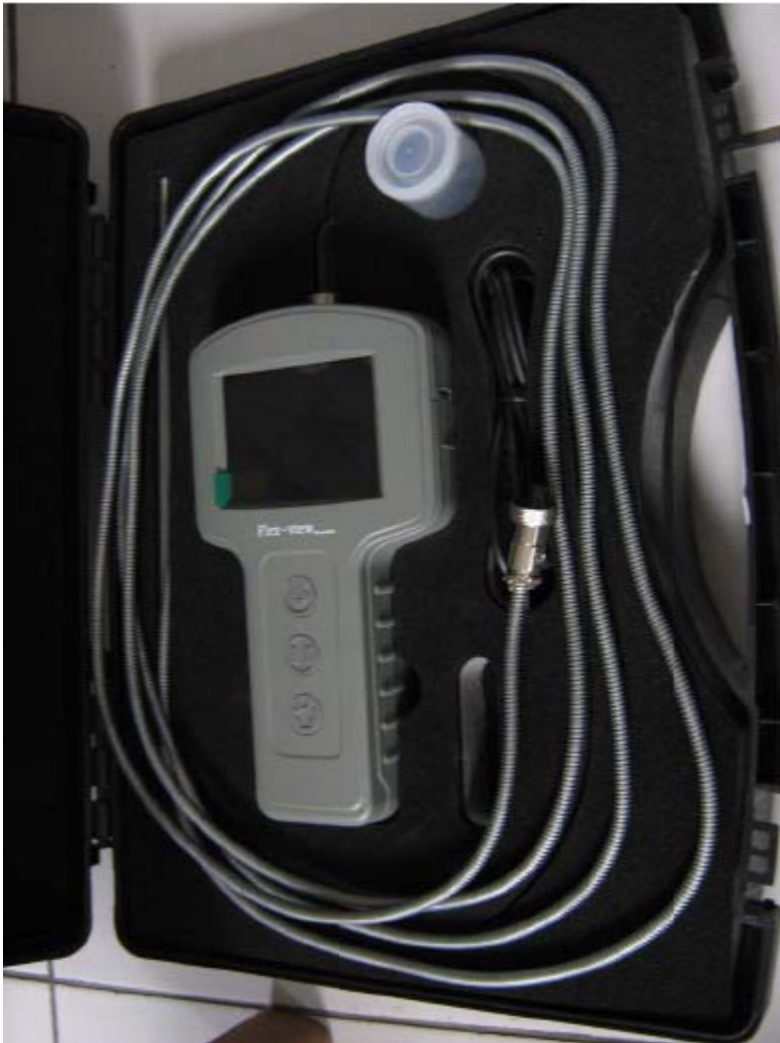
3 meters sensor length