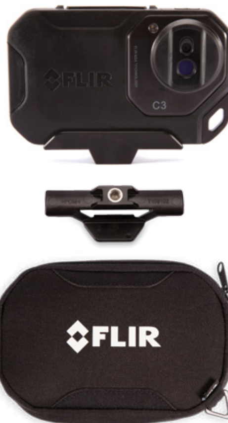
FLIR C3 with Tripod Mount & Carry Pouch

Specifications are subject to change without notice. For the most up-to-date specs, go to www.flir.com