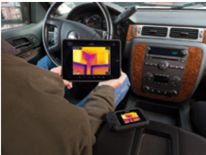
Upload images to FLIR Tools over Wi-Fi